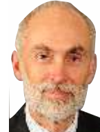
Neville Horner Committee