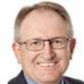
Jim Walker Motor Museum