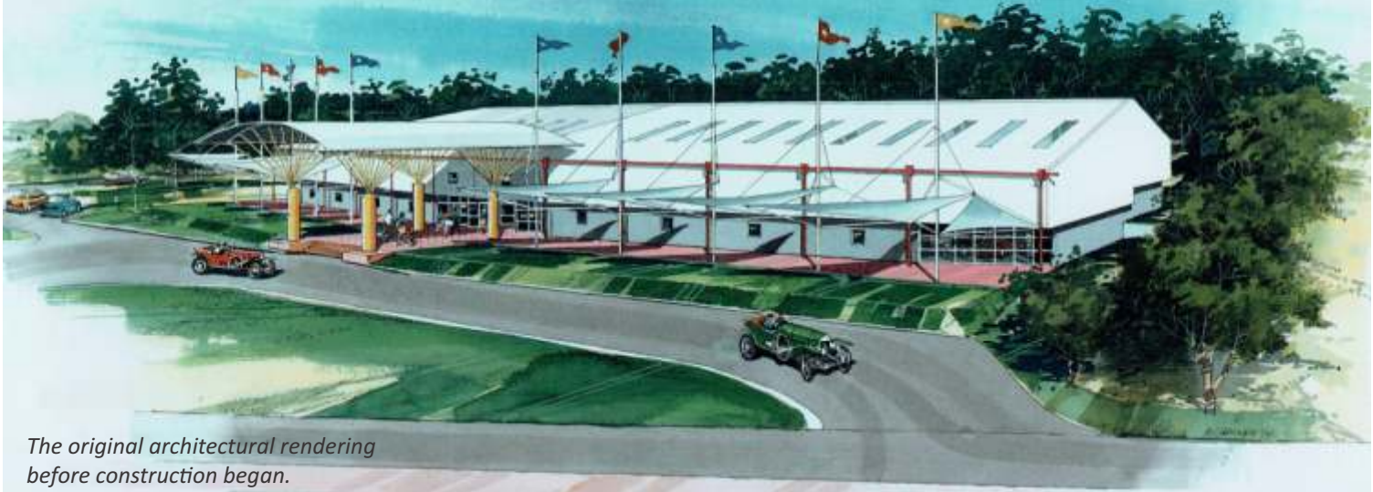
The original architectural rendering before construction began.