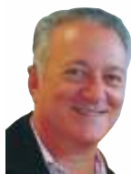
Paul Blank Committee